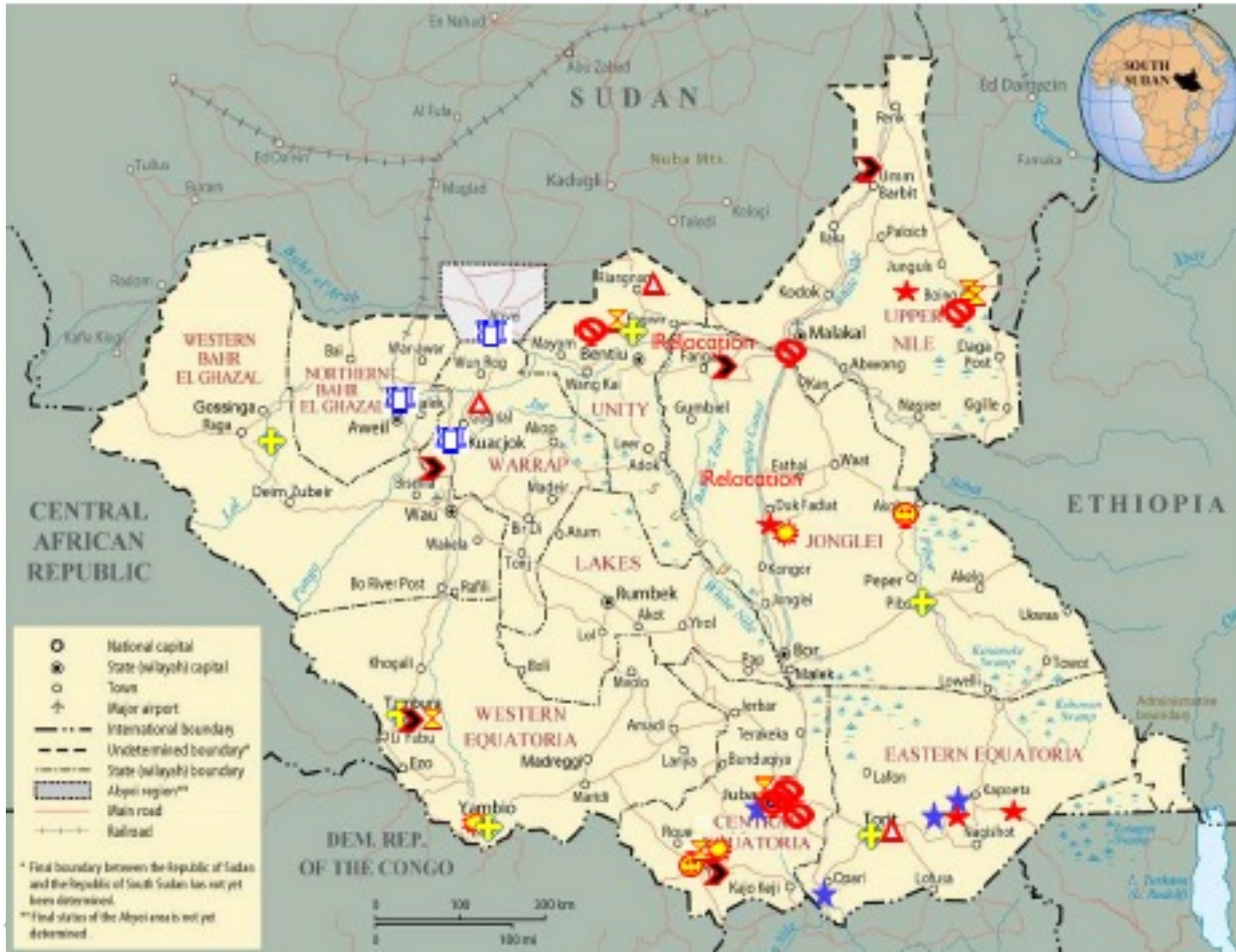
A Map Showing the Spread of Significant Incidents Across South Sudan During the Reporting Period 08 – 14 August 2021