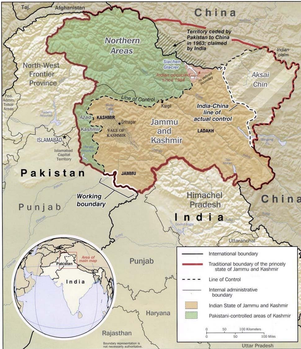
Figure 1: Map of Kashmir Region

Source: U.S. Institute of Peace (n.d.) with district labels added by authors